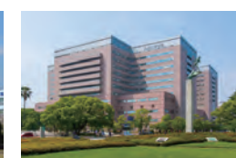
Kyushu University Hospital