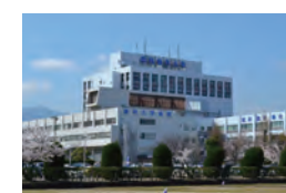
Fukuoka Dental College Medical and Dental Hospital

Activities in the community in which Fukuoka Gakuen, an incorporated educational institution, have accumulated in the fields of medical care, health care, and welfare for more than 40 years, have tied up with a large number of providers of practical training.