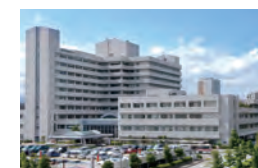
National Hospital Organization Kyushu Medical Center