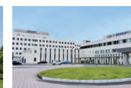
National Hospital Organization Fukuoka-higashi Medical Center