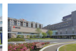
Japanese Red Cross Fukuoka Hospital