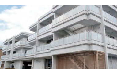
Gakujikai Sunshine Center Elderly Nursing Home