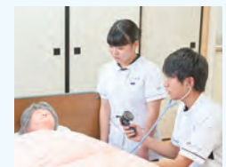
Gerontological Nursing: Seminar

Students will integrally learn through lessons and exercises so that they can think about and practice the nursing methods based on scientific evidence, while developing assistive relationships with patients, in order to solve the patient's health problems. The aim is to develop nursing from the patient's point of view, by considering not only physical problems but also mental problems.