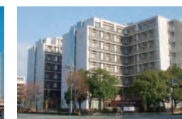
Kyushu Central Hospital of the Mutual Aid Association of Public School Teachers