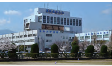
Fukuoka Dental College Medical and Dental Hospital