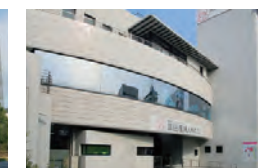
Medical Corporation SWC Sanada Women's Clinic