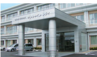
Sunshine City Health Care Facility for the elderly