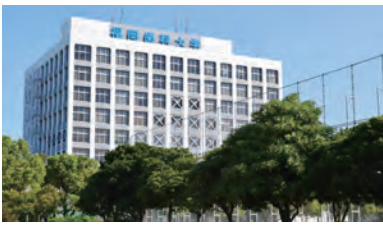
Fukuoka Dental College

In order to contribute to ongoing improvements in the quality of regional medicine and assist in the realization of a healthier and longer-living society, Fukuoka Nursing College was established in April 2017 as a new educational institution that trains nursing professionals to respond to the future demands of regional medical and nursing care.