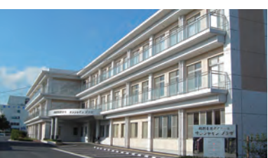
Gakujikai Sunshine Plaza Elderly Nursing Home