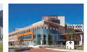
Fukuoka City Hospital Organization Fukuoka Children's Hospital