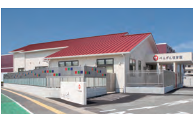
Penguin Nursery School