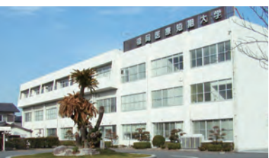
Fukuoka College of Health Sciences